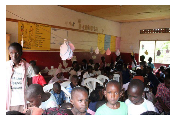
Children at school

Please complete the following and include with your payment.