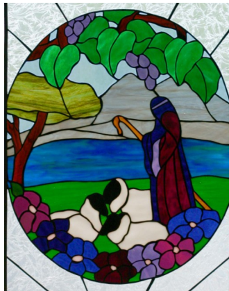
"I AM the Good Shepherd." John 10:14

Sept. 20 Invitation to banquet Matthew 22:2-14